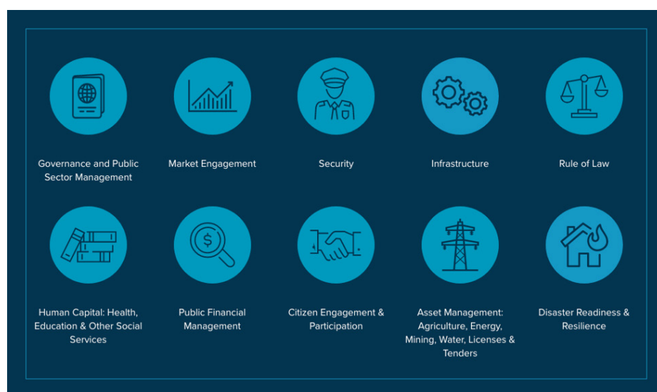
Figure A1 - Ten functions of the state

The idea is to build these 'core' components or functions first, recognising that certain groundwork must be laid first in order to build and broaden the remaining functions of the state in an inclusive and sustainable way. There are interdependencies and feedback loops between these functions, and understanding those dynamics is critical to getting the sequencing and prioritisation right.