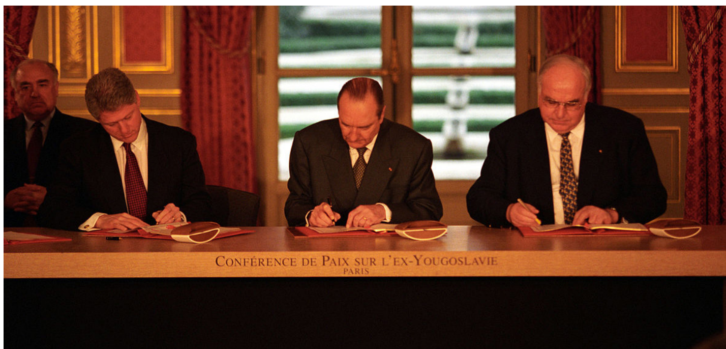
President Clinton, French President Jacques Chirac, and German Chancellor Helmut Kohl sign the Balkan Peace Agreement in Paris, France.

Imposed peace takes place when regional or global public opinion finds the incidence of ethnicocide unacceptable and a mechanism is found to force other governments to intervene. Bosnia and Herzegovina and Kosovo illustrate cases of imposed peace as a mechanism of peace-building in conflicts where other mechanisms proved ineffective or were not tried early enough to be effective. This has, however, only happened in the case of the breakup of Yugoslavia, where genocide sat uneasily with the European conception of their civilization. One of the reasons is the expense; vast resources are required to maintain the peace, even years after the intervention.