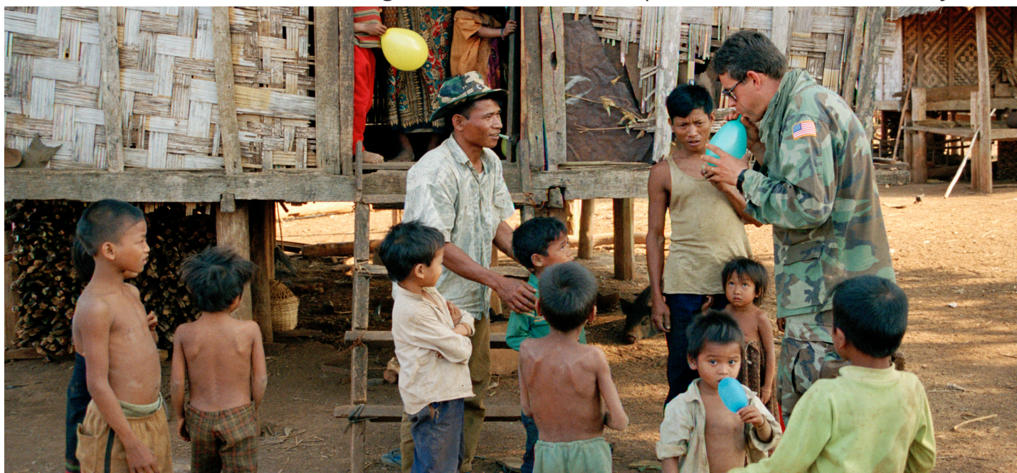
A military observer with the United Nations Transitional Authority in Cambodia (UNTAC).

The absence of international financial institutions from the process is notable; the political and economic processes are clearly not integrated or aligned. Quite a number of the agreements contain clauses for seeking financial resources from the international community as well as mobilizing domestic resources. However, as pointed out earlier, most of the time these calls lack specificity. Others seek commitments from troop-contributing countries or large-scale deployment of UN personnel, such as in the case of UNMIK and UNTAET. In some, a role for civil society organizations is envisaged, as in the cases of Guatemala and El Salvador. Maintaining the commitment of the international community over the medium- to long-term is the real challenge, as all the attention tends to be in the first years, while empirical research has shown that 50% of conflicts with negotiated settlements relapse into violence within five years. 37