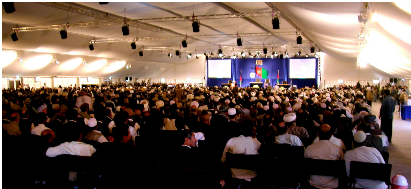
The Loya Jirga held in Kabul in 2002 which resulted in the formation of the Afghan Transitional Administration.

stakeholders, thereby opening up the possibility of sustained attention from the United Nations (UN). Afghanistan, Cambodia, and Timor-Leste represent cases where the UN has been cast in the critical role of facilitator, co-producer, or administrator of a process of state-building through the constitution a legitimate center for a government that would have legitimacy at home and abroad. Since in Timor-Leste there was little doubt about the nature or identity of the leaders that would assume power at the end of the transitional period, we shall focus on Cambodia and Afghanistan.